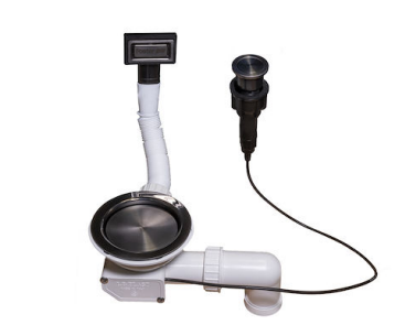
VIDAGE FADE PUSH GUN METAL A407 A20