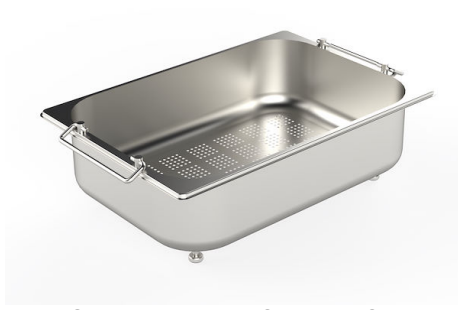
CUVETTE PERFOREE INOX